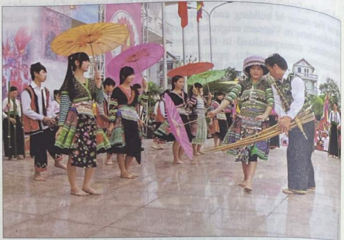
Preserving and promoting the cultural values of the Vietnamese people