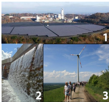
Fig. 5. Creating renewable energy, an opportunity of post-mining. 1) Photovoltaic plant on a mud pond; 2) Heat from mine water; 3) Windmill on a dump hill. (14)