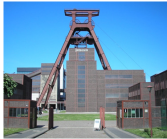
Fig. 4. Industrial monument: pit frame head of shaft XII of colliery Zollverein. Rys. 4. Zabytek techniki: wieża szybu XII kopalni Zollverein.