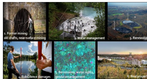
Fig. 2. Examples for Risk Fields in Post-Mining.