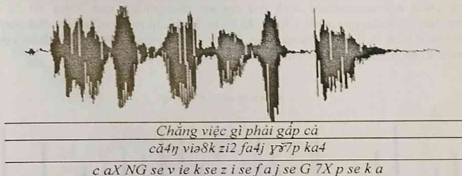
Figure 1. Example of training speech and transcription in Vietnamese word ( top ), in IPA ( middle ) and in XSAMPA ( bottom )

The baseline system was built as a simple Vietnamese phoneme recognition system. This system was developed using an open source ASR framework (CMU Sphinx 4 ) and training with VNSpeechCorpus [20] consisting of 20 hours of recorded speech with more than 30 speakers from North of Vietnam. Unlike training for a typical ASR system, the training process of acoustic model for phoneme recognition system uses the input of speech signal transcribed in phonemes, instead of normal words. Therefore, all the transcriptions in training corpus were converted into phone sequences, as shown in Figure 1.